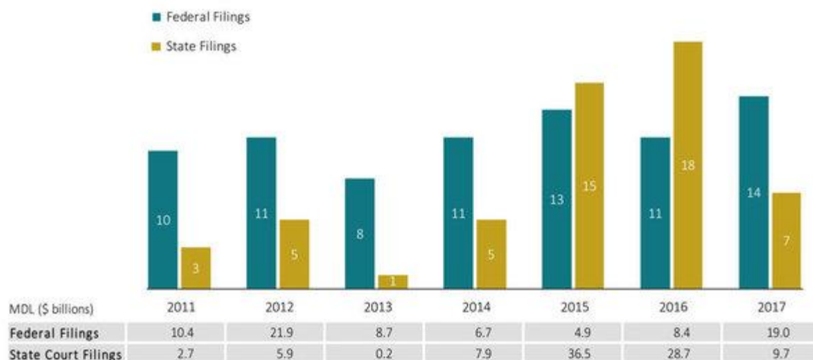
FIGURE 1: NUMBER OF FILINGS WITH SECTION 11-ONLY CLAIMS IN FEDERAL AND CALIFORNIA STATE COURTS 2011–2017